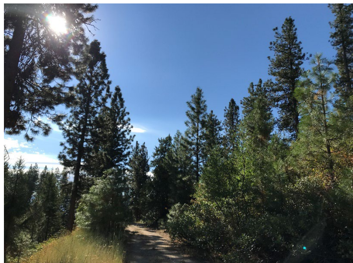
Figure 1. High stand densities in the project area may be contributing to declines in stand health, including tree mortality caused by insect and disease.

The project area exhibits stand densities in some places that may be contributing to declines in stand health, including tree mortality caused by insect and disease. There is a need for targeted treatments to increase landscape diversity, which lowers the risk for uncharacteristic disturbances from balsam wooly adelgid and potentially other forest insects and disease.