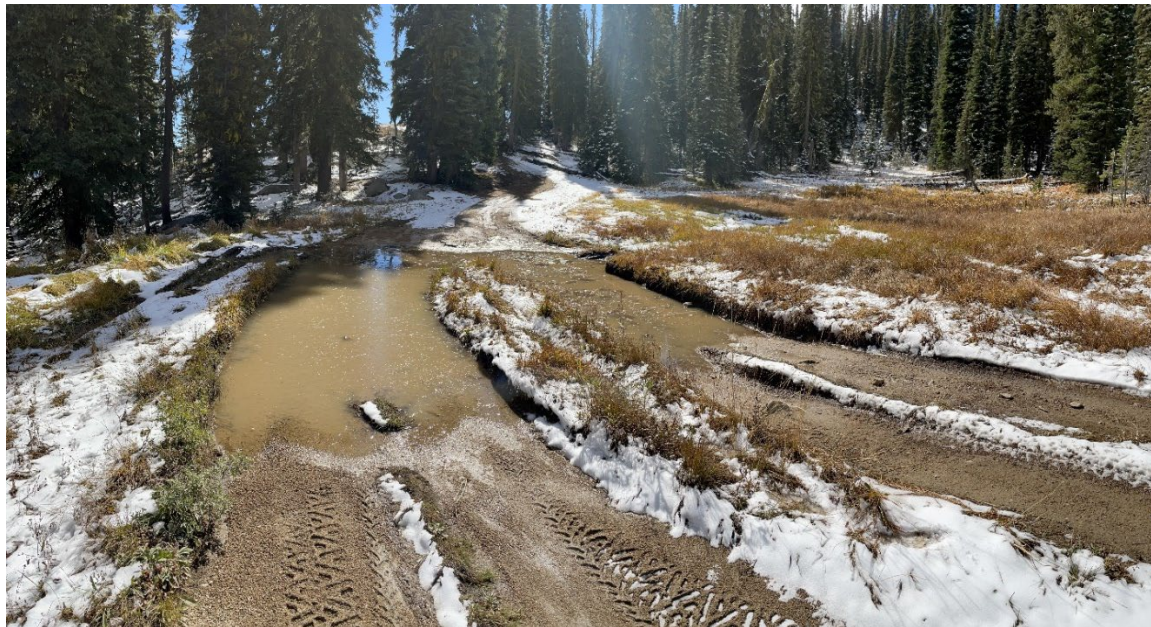
Figure 6. View of meadow damage on Road 314 looking south.

Aquatic/riparian habitat improvements are proposed on an unnamed meadow east of Freeman Peak in the Headwaters Mores Creek Subwatershed. NFS Road 314 currently travels through portions of this meadow. The road itself has widened due to excessive use and rerouting which has shifted the width of the road to two to three times the normal width. Vehicles are causing rutting, soil displacement, and accelerated erosion of the banks and meadow habitat, causing the eventual dewatering of the meadow's existing footprint, which will lead to continual shrinking and eventual disappearance from the landscape. Meadow restoration actions include soil decompaction, soil bulking in rutted areas, and planting of native vegetation. Activities would occur parallel to meadow encroachment activities described above. Additional meadow areas found to be in degraded condition during field assessment could be treated in a similar fashion.