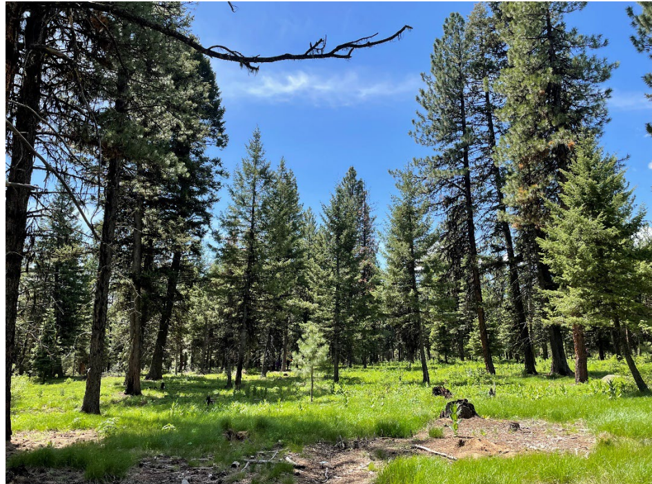
Figure 5. The Bear Face Project area near McCall on the Payette National Forest. Previous commercial and non-commercial treatments (timber harvest, thinning, prescribed fire) have helped turn this wildland-urban interface area into a healthy, adaptable landscape, resilient to wildfire.

Mechanical methods to reduce fuels include pruning and/or machine cutting with a mulching or mastication head on slopes less than approximately 40%. Surface fuels would be either removed for biomass, mulched, chipped, masticated on site, or piled and burned on site. Piling would be accomplished either by hand or machine, on suitable slopes.