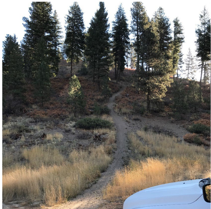
Figure 7. This unauthorized route adjacent to an authorized trail could be proposed for decommissioning. Such work may include ripping the surface, placing logs and other natural debris over the trailhead, reseeding it with native weed-free seed mixtures, and installing barriers and signage. Closing this route would encourage recreators to use the nearby authorized trail system.

Unauthorized route and dispersed recreation site restoration may be proposed to restore resource conditions and reduce degradation for a number of native plants and animals, including the sensitive Sacajawea's Bitterroot and threatened White Bark Pine. Decommissioning unauthorized routes would restore areas by blocking vehicle access. Unauthorized route decommission activities would be determined on a case-by-case basis but could include installing waterbars in the trail tread to limit further erosion and discourage future use, covering the trail with locally available brush and rocks, installing signs, constructing rock or log barriers, installing gates, and/or planting and seeding with appropriate vegetation. Restoration of dispersed recreation use areas would be achieved by closing locations to vehicles by installing boulder barriers and signs and/or planting and seeding.