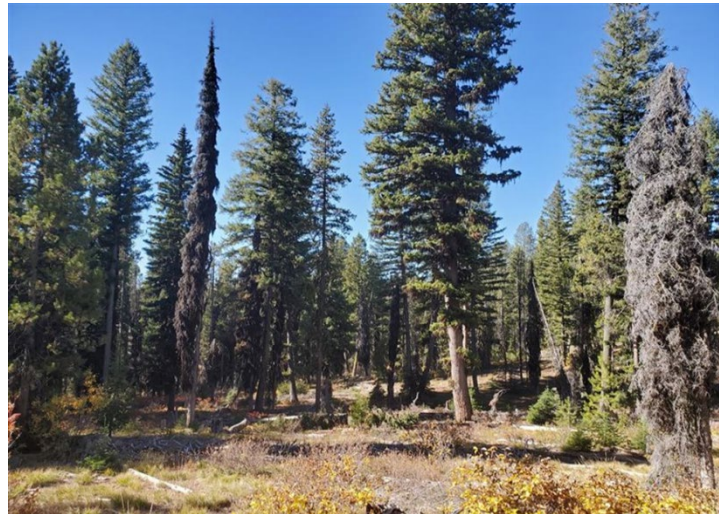
Figure 2. Stand conditions typical in the project area, showing dead/dying subalpine fir caused by balsam woolly adelgid. Affected trees are especially prominent in the project area adjacent to Highway 21 at the higher elevations near Mores Summit.

Other insects and disease exist on the landscape, including Douglas-fir beetle, dwarf mistletoe, Ips pine engraver, and mountain pine beetle; the extent of how they are affecting the forest is being assessed. Treatments may be proposed to address these vectors and increase resilience to them. Field verification is ongoing.